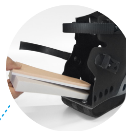
Wedge-shaped insole system for optimal rearfoot weight-bearing