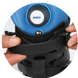
Practical & secure closure system