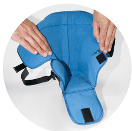
Wide opening for easy foot insertion

Using the Body Armor® Pro Term Foot Stump Orthosis during post-op recovery, changes to the limb can be compensated using the soft lining with integrated pump. The BAPT enables individual adjustment to the changing conditions of the stump. The ankle-spanning shaft in a 90° position stabilises the upper and lower ankle. The ventral support strap and the variable/secure closure system enables circular, flat compression. The wedge-shaped outsole and insole in dorsal extension also ensures optimal rearfoot comfort.