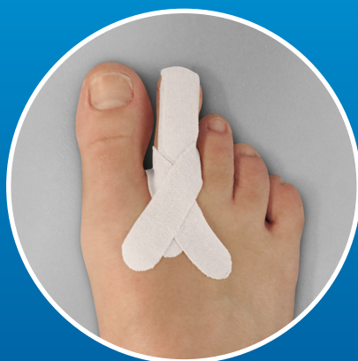
Claw / Hammer toe osteotomies